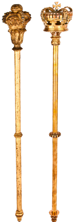
The Legislative Assembly's first (left) and second (right) maces

The third and current mace of the Legislative Assembly of British Columbia was adopted in 1954. It was entirely handmade by Jefferies & Company, Victoria silversmiths, from British Columbia silver, plated with 24 carat gold, weighing five kilograms (11 pounds). The traditional design has a long shaft topped by a deep bowl surmounted by a representation of St. Edward's Crown and the Royal Cypher. The bowl bears the coats of arms of Canada and British Columbia, and four embossed scenes depicting the province's forestry, fishing, farming, and mining industries. These scenes are similar to the paintings in the Upper Rotunda of the Parliament Buildings.